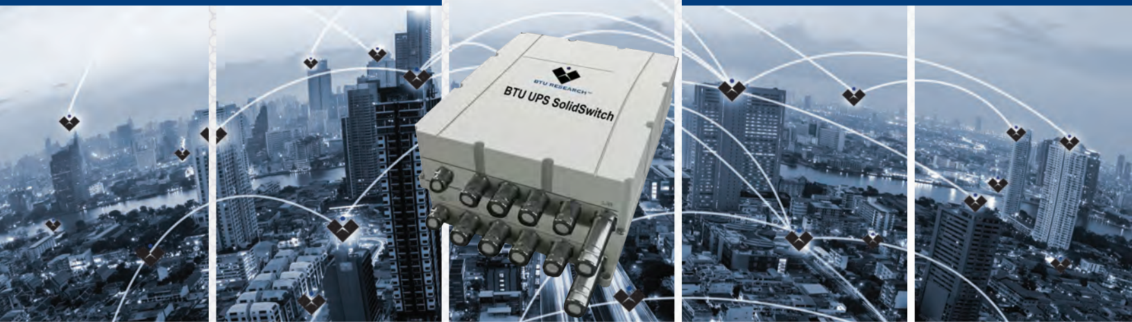
UPS SolidSwitch 8 Port Switch